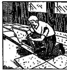
Turn tiles over