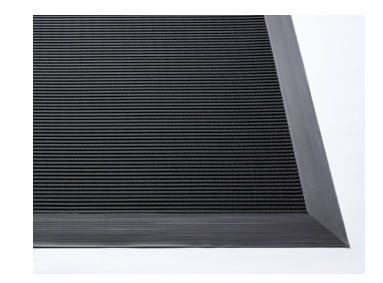
Certified slip resistant Excellent drainage Chemical, oil and acid Boosts productivity Contours to uneven surfaces