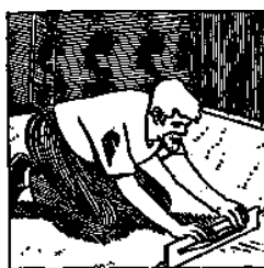
Prepare a smooth surface