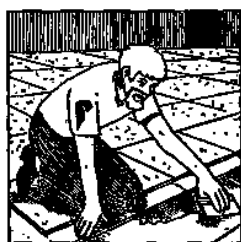
Spread the glue