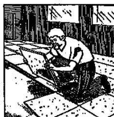
Turn tiles over