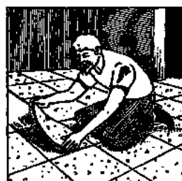
Glue the tiles down